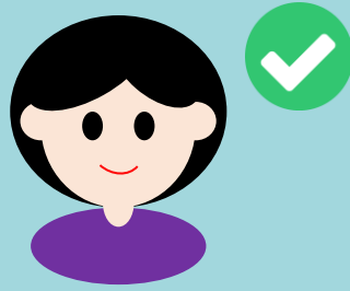
Additional Person to check in facility